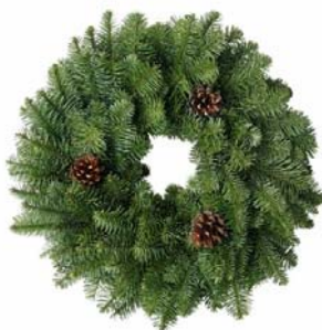
16" wreath of noble fir and pinecones $18