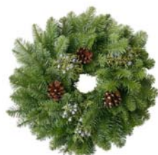
12" ring of noble fir, pinecones and juniper berries. $14