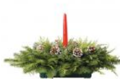
24" table centerpiece with a variety of greens, pinecones, and juniper berries with your choice of candle color: Blue, white or red $30

Make checks payable to WHMS Middle School .