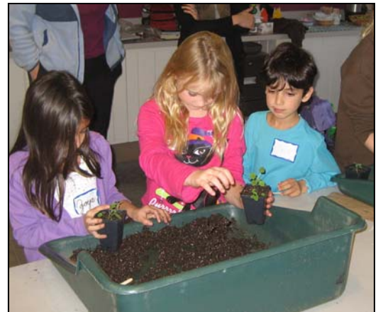
Each child planted a pot of catnip to bring home.