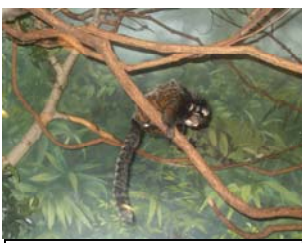
A monkey hanging out.