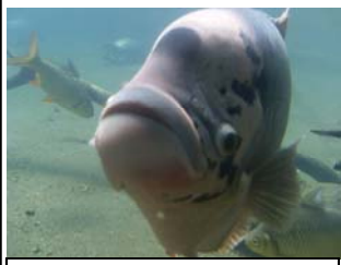
One of the many big fish at the Bronx Zoo.